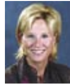
DONNA DE VARONA New York, NY