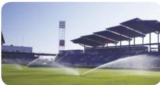
Dick's Sporting Goods Park (Colo.)

The Foundation is grateful for the ongoing support of its Corporate Partners. Each Partner's annual donation increases the resources available for the Foundation's grant programs. ussoccerfoundation.org/prc