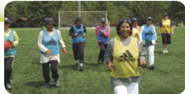
Members of the Afghan exchange program received coaching certifications during their visit to the United States in July, 2007.

To find out how you can get involved visit ussoccerfoundation.org .