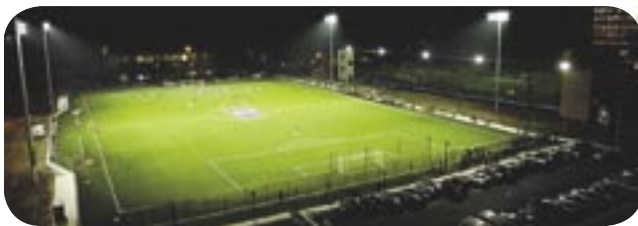
2007 ACF Grantee, University of Bridgeport (Bridgeport, Conn.)

In addition, the Foundation published The Soccer Field Handbook in 2007, with the assistance of Soccer America . The Handbook is a comprehensive resource on all things related to the development of soccer fields in your community, from getting local political approval to deciding whether to use synthetic or natural grass.