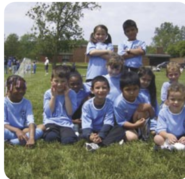
INNER CITY SOCCER (FORT WAYNE, IND.)

The Southern California Youth Soccer Organization's Interliga Select Program will take place in some of the most economically depressed urban areas of Southern California, including Compton, South Central Los Angeles, Norwalk, San Bernardino, the San Fernando Valley and Orange County. These areas are home to